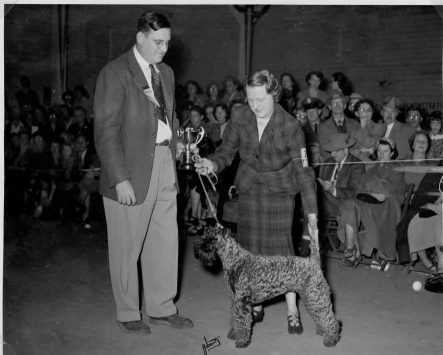
CH. FOXHILL'S WITCH.