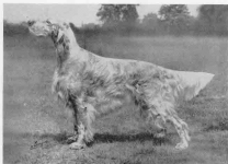
CH. ROCK FALLS COLONEL