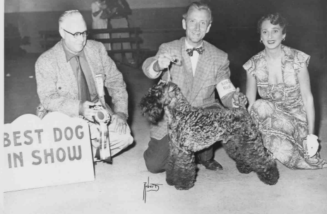
CH. PRINCE TOPPER.