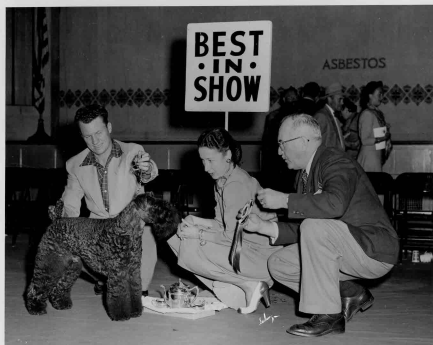
CH. KERRINACH 1953