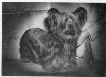
CH. LITTLE CAP OF STONEBRAE