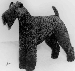
GR. VIERK'S SHOW OFF