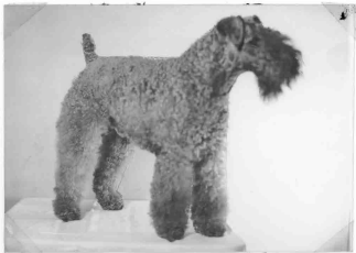
ch. Paddy Boy of Delmin.