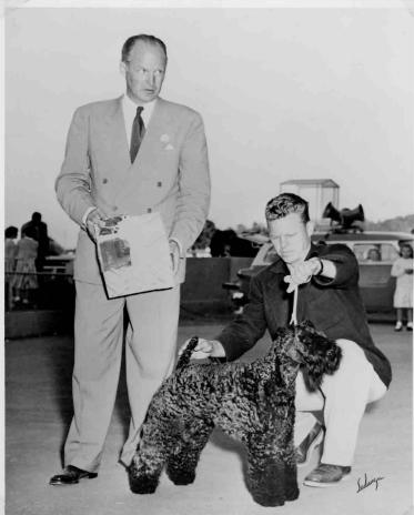
CH. VIXEN'S PARMAIRS.