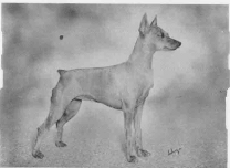
CH. PATZIE V. MILL MASS