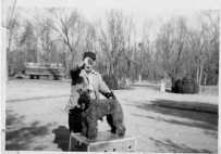
Ch. Deeds Show Off