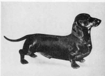
CH. ALLEGRO OF GERA