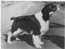
CH. KING PETER OF SALIELYN