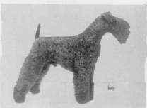
CH. FOX HILLS THUNDERBOLT