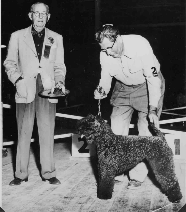
H KILKRAVEY KELLEEN