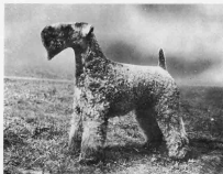
Ch. Skipper of the Jean