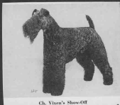
Ch. Vixen's Show-Off