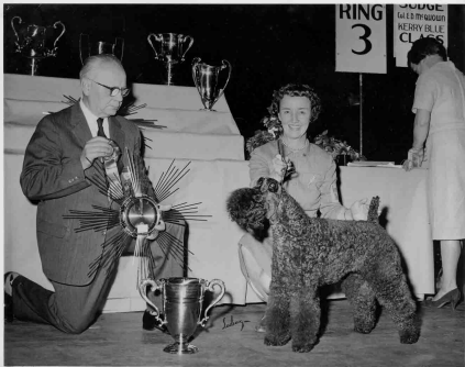
1941 S. Cal. Chicago's Showcase. Finished 1st per. USKAT. travelling Spec. "note her color now!" S. Cal. fall Specialty.