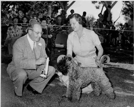
CH. THILTEANN PRINCESS JILL.