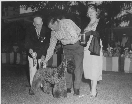
CH. PARKIE'S WHIRLAWAY