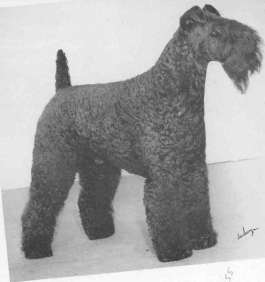
CHAMPION VIXEN'S SHOW-OFF