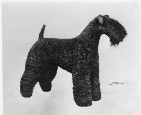
CH. KILROY'S SALLY BAY