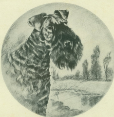
CH. HILARIOUS OF GAYTERRY (February, 1928 — August, 1960)

Still the only Kerry Blue to win the best in show award of Montgomery B.B. Show. Was B.B. at New England Specialty last time shown (1945) finishing with a low month with B.B. Montgomery.