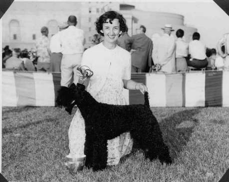
20 - BLUEEYE SHOWCASE