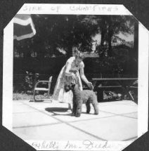
Shells Mr. Deeds