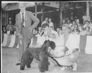
CH. VIXEN'S SHOW OFF

In 1955, although he has not been shown as much, he has 12 groups and 4 best in shows to date.