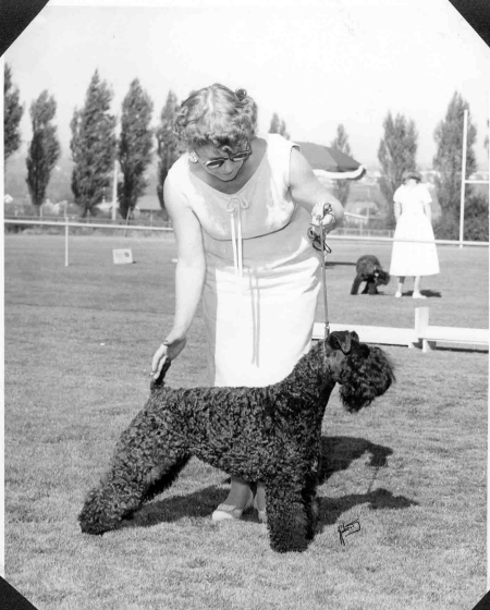
C.H. ALUCOTE LORELIE SISTER TO BRILL