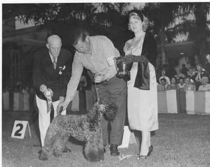
C.H. Foxhill's Whirlaway