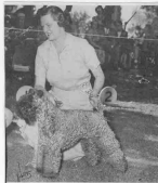
TAILTEANN'S PRINCESS JILL