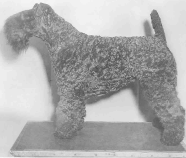
ONE OF MISS SAMUEL'S OF DUNDAS