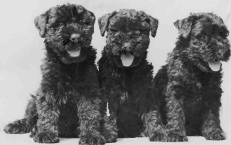
pups by Ch. The Bombardiers ex Ch. Helene of Gayberry 12 weeks old